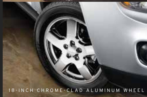
18-INCH CHROME-CLAD ALUMINUM WHEEL