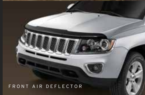
FRONT AIR DEFLECTOR