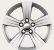
17-inch Tech Silver Aluminum (standard on 4x4 models)