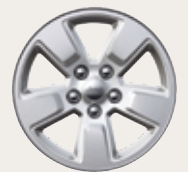
16-inch Aluminum (standard on FWD models)

SMOKER'S GROUP: Removable ashtray and lighter element