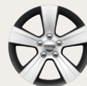
17-inch Polished Aluminum with Granite Painted Pockets (standard)

SMOKER'S GROUP: Removable ashtray and lighter element