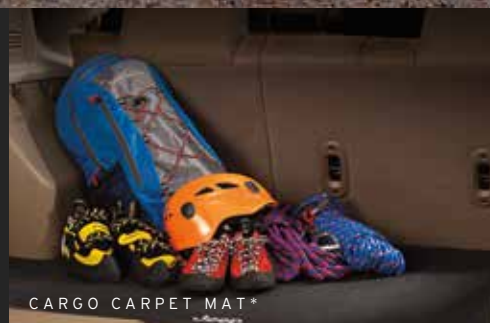
CARGO CARPET MAT*