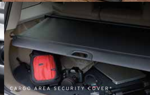
CARGO AREA SECURITY COVER*