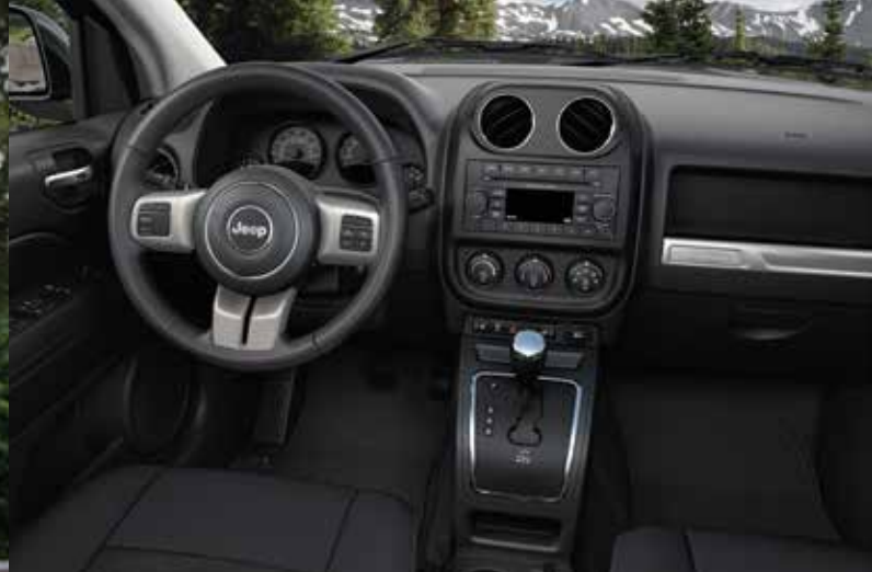
INTERIOR: McKinley Vinyl/Sport Mesh Cloth with Light Slate Gray accent stitching; Dark Slate Gray/Black (standard)