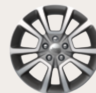
18-inch Polished Aluminum with Mineral Gray Pockets (available)

SMOKER'S GROUP: Removable ashtray and lighter element