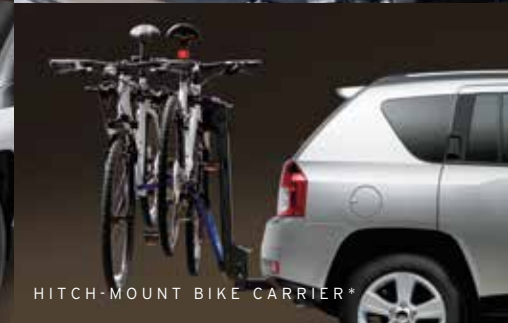
HITCH-MOUNT BIKE CARRIER*