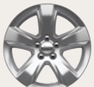
18-inch Chrome-clad Aluminum (available)