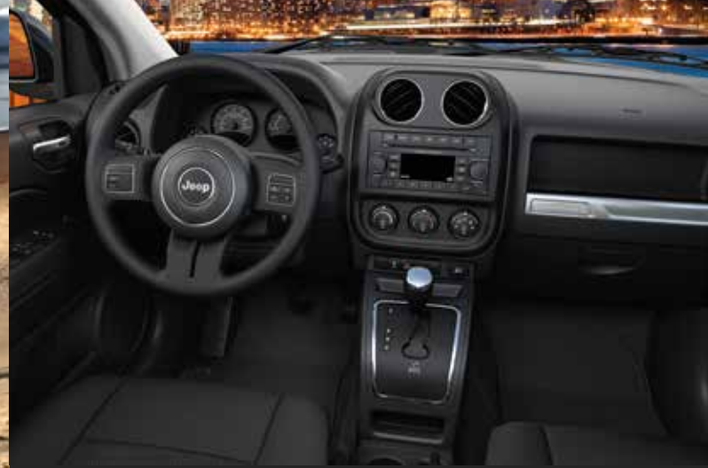
INTERIOR: 1) Duet Cloth/Cubic Cloth: Light Pebble Beige (standard) 2) Duet Cloth/Cubic Cloth: Dark Slate Gray (standard)